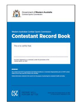
Figure 3: Contestant Record Book (CRB)

Each Contestant is issued with a Contestant Record Book (CRB) upon registration (Fig.3). The CRB contains important medical information and must be inspected by the RMP during medical examinations (both pre and post contest). WA registered Contestants CANNOT compete if they do not supply the RMP with their CRB.